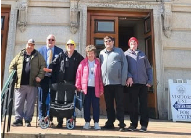
STIR members at the Statehouse during DD Awareness and Advocacy Day.

Our Mission: To improve the lives of persons with disabilities