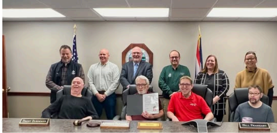
STIR members receiving proclamation of DD month at the Seneca County Commissioners meeting.